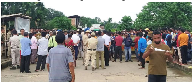
IT Correspondent Jiribam, July 08:

The locals of Jirighat and the neighbouring areas were annoyed over the high charge of COVID-19 testing at the entry gate of Jiribam District from the neighbouring areas of Assam.