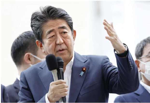
Agency Nara, Japan, July 08:

Former Japanese Prime Minister Shinzo Abe is dead after being shot on Friday while delivering a stump speech in the western city of Nara two days ahead of a national election, a ruling party source said.