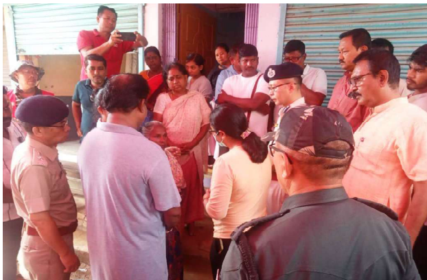
IT News Imphal, July 08:

The military regime of the neighbouring Myanmar country is still tight lip over the brutal killing of two Indian inside their territory on July 5, despite repeated appealed to hand over the corpses to their respective families. Even as the top officials of the government of Manipur including the IGP of state police is stationing at Moreh and trying all effort to calm the anger of the