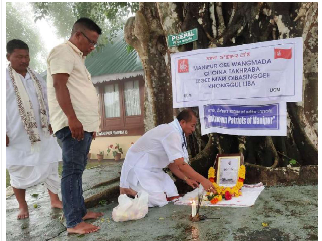
IT News Imphal, July 08:

The team of United Committee Manipur (UCM) who had left Imphal for Andaman and Nicobar Island today paid tribute to the Manipuri King Kullachandra and other 22 unknown martyrs at